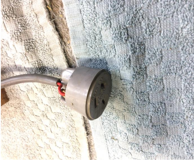
Pictured above: An electrical hazard that caused a staff incident which resulted in an electric shock.