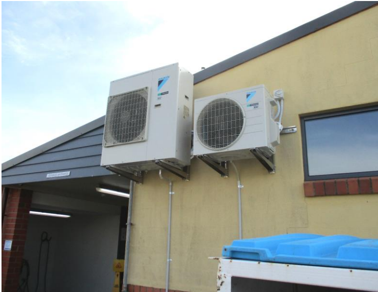
Pictured above: New heating and cooling systems

These units have recently been installed near the back entrance to the laundry. The units will provide heat in the winter and more importantly, a cooling system in the summer for staff working in the facility laundry.